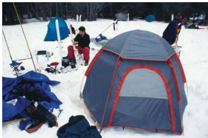
Concentrate camp activity in high-use areas such as this frontcountry campsite.

Frontcountry camping is ideal for Scouts learning the basics of living out-of-doors. With several frontcountry campouts under their belts, they will have a much better idea of what to carry when they travel farther from the road, and how to manage camps at more remote destinations.