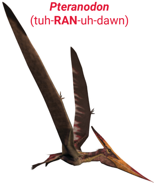
Pteranodon (tuh- RAN -uh-dawn)