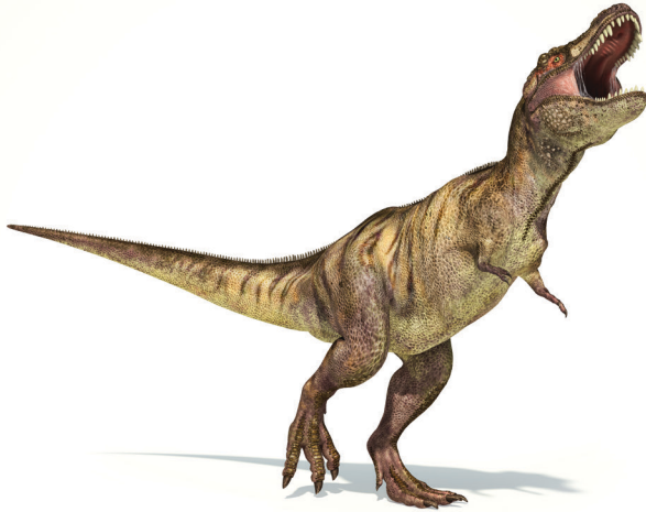
Tyrannosaurus Rex (tuh-RAN-uh-SAWR-us)