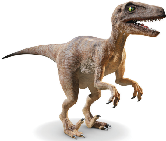
Velociraptor (veh-loss-ih- RAP -tor)