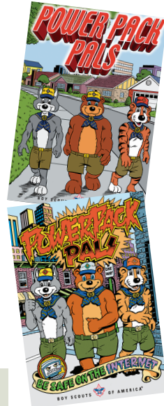
Power Pack Pals

For Scouting's leaders and parents, the BSA has a video training session, Youth Protection Guidelines: Training for Volunteer Leaders and Parents . This is available from your local BSA council, with regular training sessions scheduled in most districts.