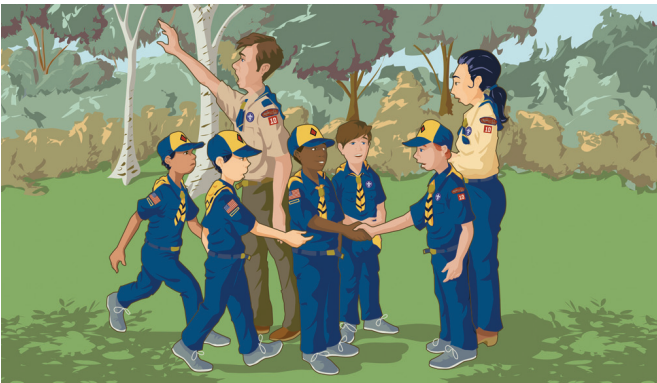
Youth Protection Guidelines: Training for Volunteer Leaders and Parents