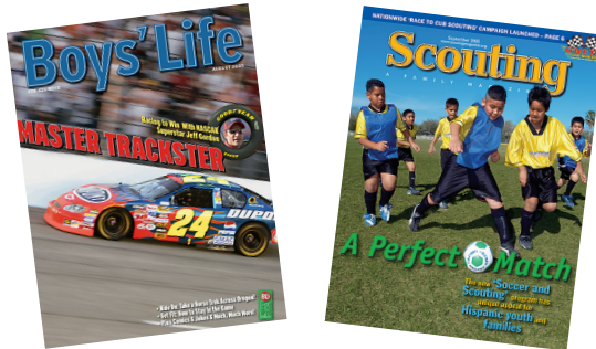
Boys' Life and Scouting magazines

In addition to these video and online materials, the BSA provides Youth Protection information to its members and families through Boys' Life and Scouting magazines.