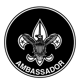
Ambassador, restricted, national Scouter.