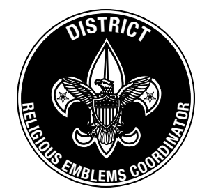
District Religious Emblems Coordinator, cloth, No 614645; district Scouter.