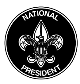
National chair, restricted, national Scouter.

Badges of office are worn on the left sleeve, position 3, except as noted.