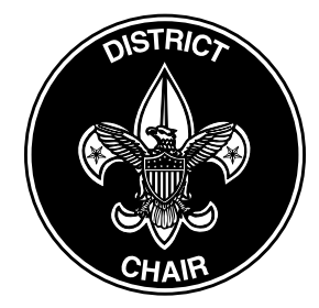
District chair, No. 267; district Scouter.

Assistant district commissioner, No. 613054; district Scouter.