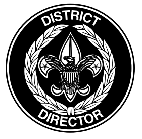
District director, No. 288; council Scouter.