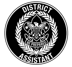
District Assistant, No. 639128; council Scouter.