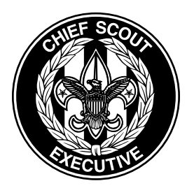
Chief Scout Executive, restricted, national Scouter.