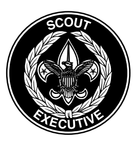
Scout executive, No. 295; council Scouter.

Badges of office are worn on the left sleeve, position 3, except as noted.