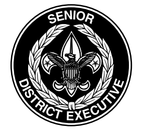
Senior district executive, No. 289; council Scouter.