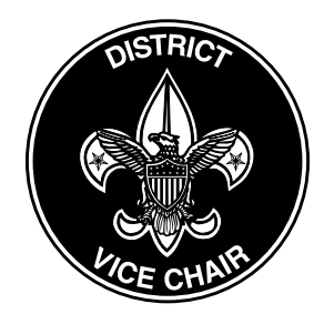
District vice chair, No. 269; district Scouter.