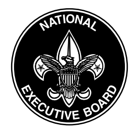
National Executive Board, restricted, national Scouter.