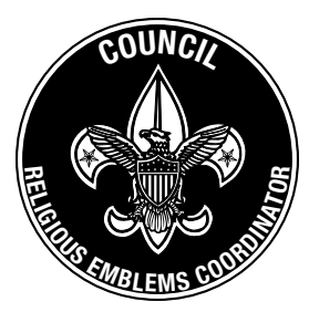
Council Religious Emblems Coordinator, cloth, No 614660; council Scouter