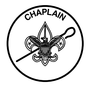
Chaplain, No. 440; council Scouter (must be ordained or appointed clergy by religious organization).