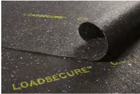
RUBBER FRICTION MAT