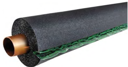
RUBBER PIPE INSULATION