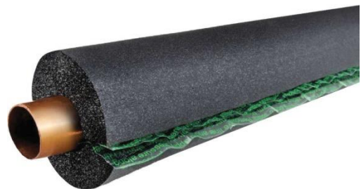
RUBBER PIPE INSULATION