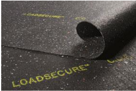
RUBBER FRICTION MAT