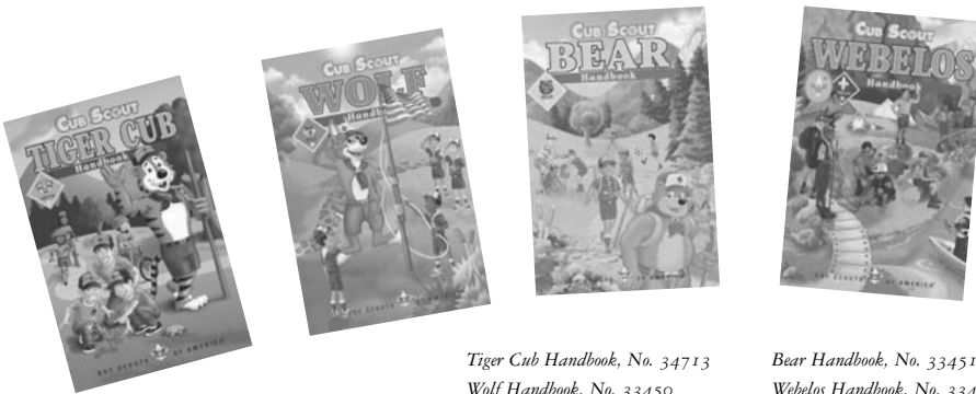
Tiger Cub Handbook, No. 34713 Wolf Handbook, No. 33450