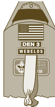
WITH DEN NUMERAL