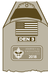
WITH DEN NUMERAL