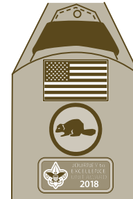
WITH DEN EMBLEM