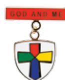
God and Me