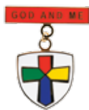
God and Me