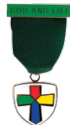
God and Life