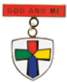
God and Me