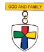
God and Family