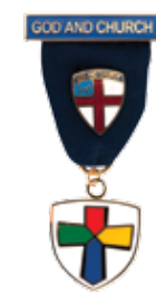
God and Church