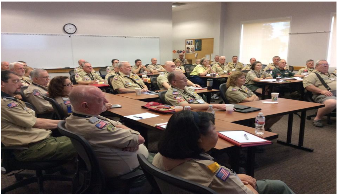
Face-to-face, instructor-led commissioner training at ScoutingU Westlake Campus

Finally, if you are passionate about instructor-led, face-to-face training and you are not part of your council's or district's training committee, you might consider volunteering some of your time and talents there. Most of those committees are always short of people to serve, and the more trained training staff we have, the more opportunities to take the training to those who need it can happen. Right?